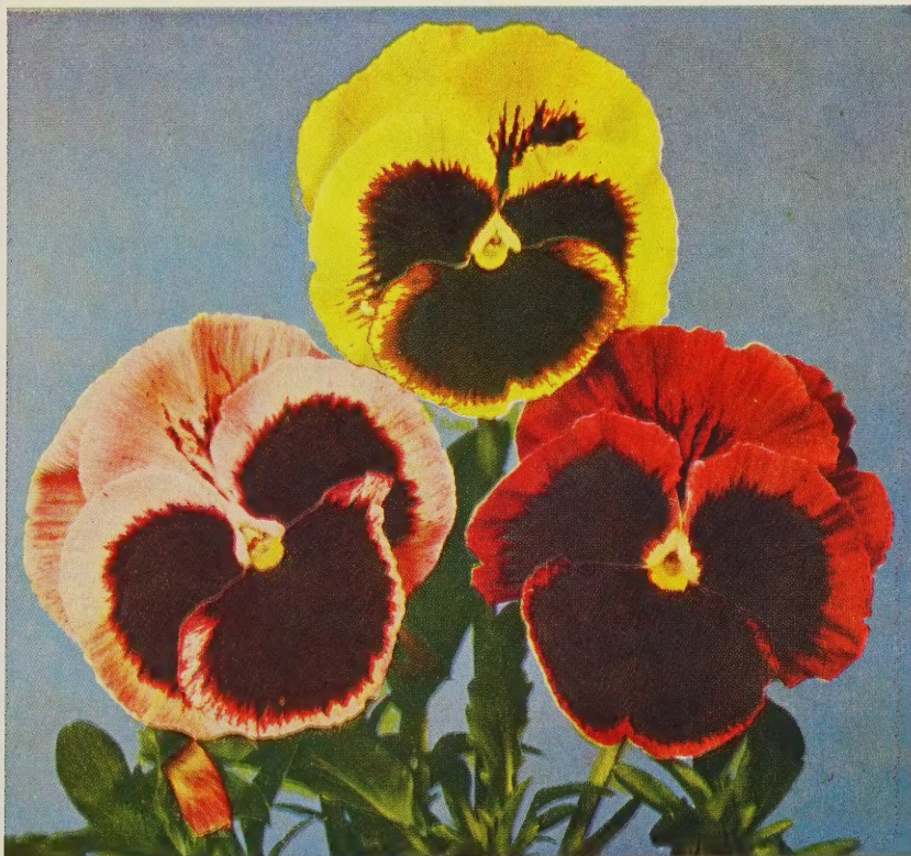
Clarkes' Giant Swiss—Just three of the many colors in the mixture.